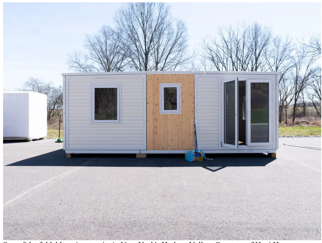
One of the foldable units at a site in New York's Hudson Valley.

After leaving the factory, the foldable home is trucked to its final location where a crane operator lifts it and places it on the ground.