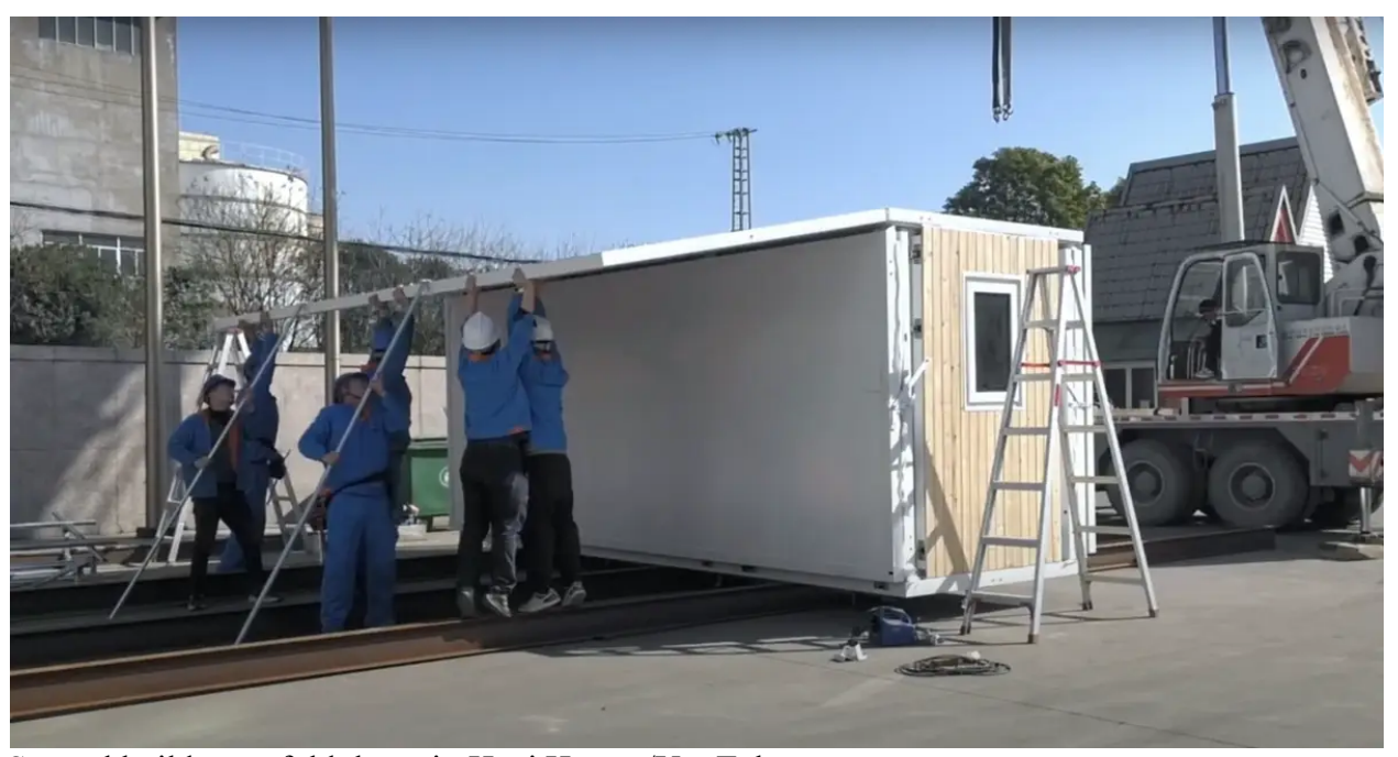
Several builders unfold the unit.

The outer portions of the house fold inward on both sides of the center. Builders unfold the roof and floor first.