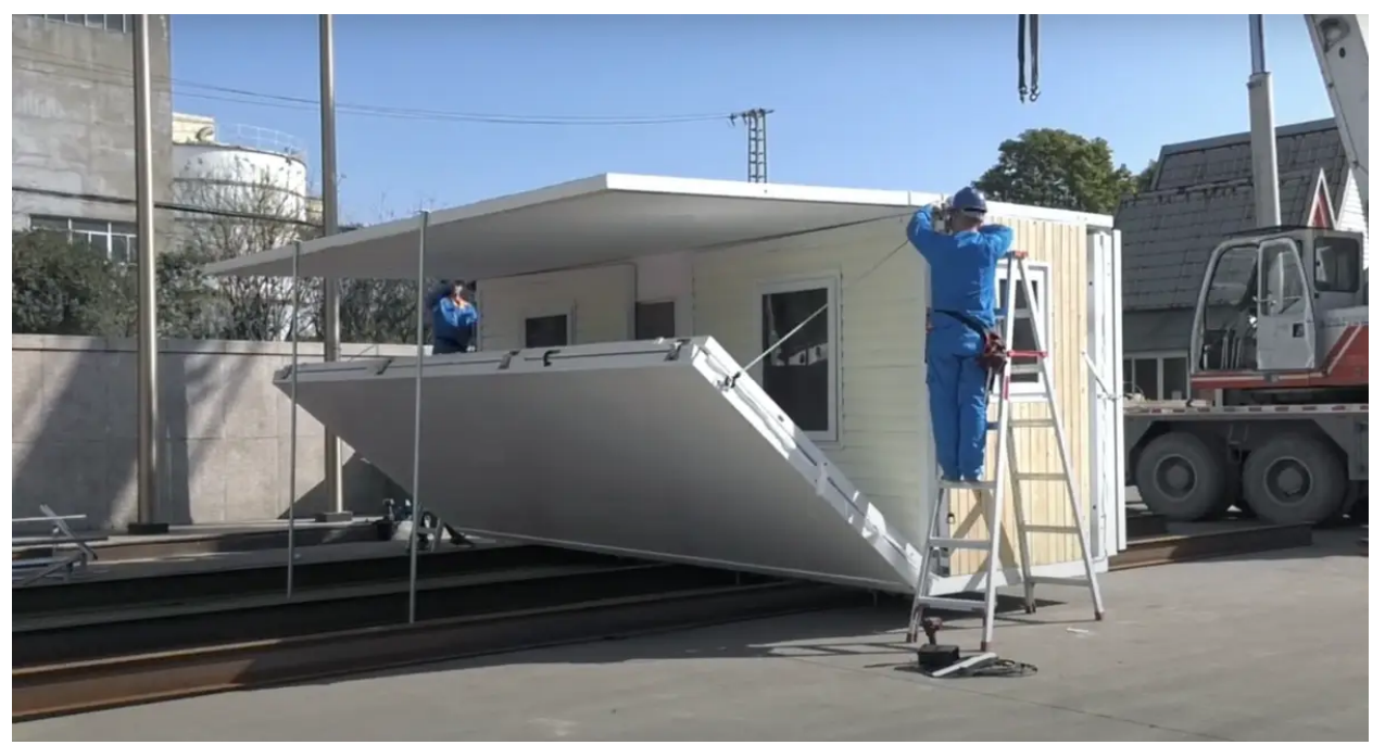
Two builders "unfold" a unit on site.

Both are 420 square feet. The Glenflesk model is a two-bedroom unit and the Heuston model is a one-bedroom unit.