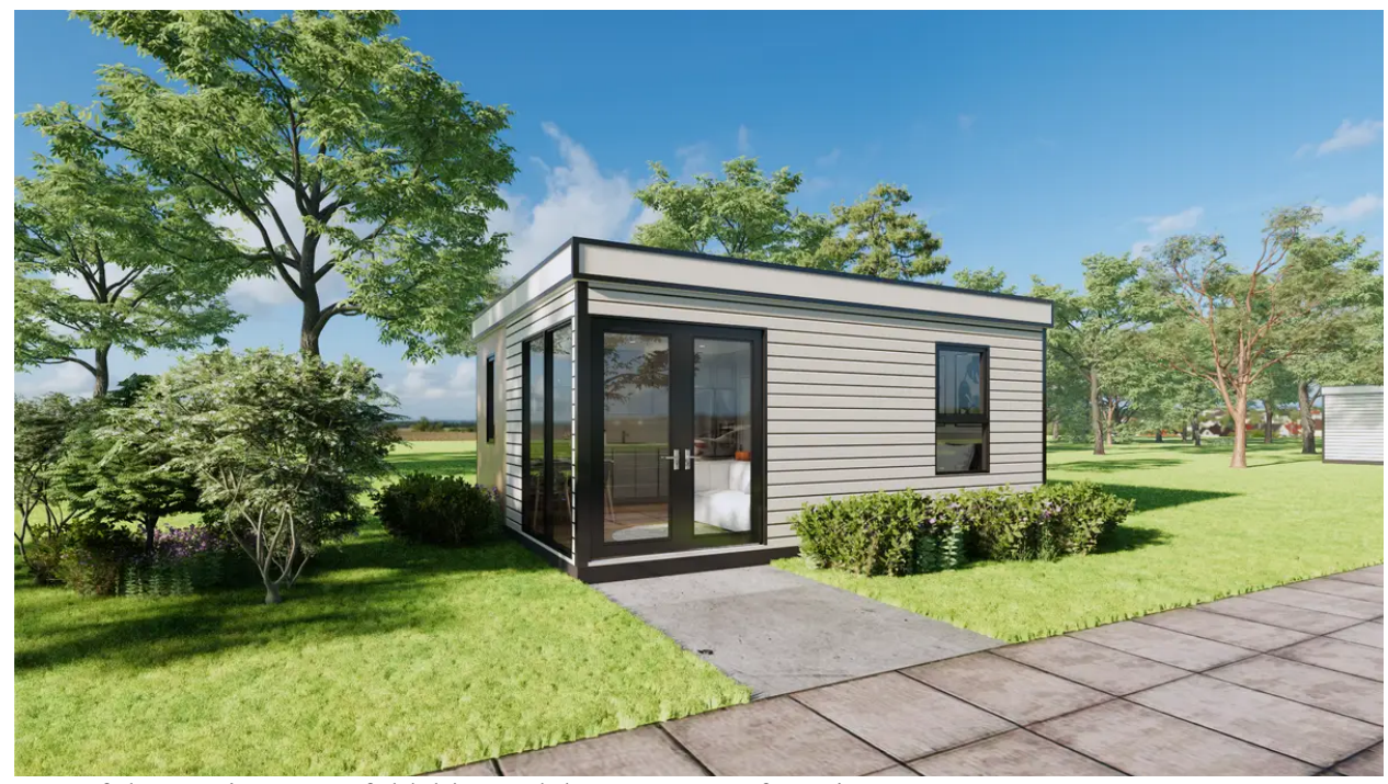
One of the Hapi Homes' foldable models.

Customers can choose from 16 available floor plans — designed by outside engineers and architects — that Hapi Homes uses to guide the construction of the framing, panels, and flooring.