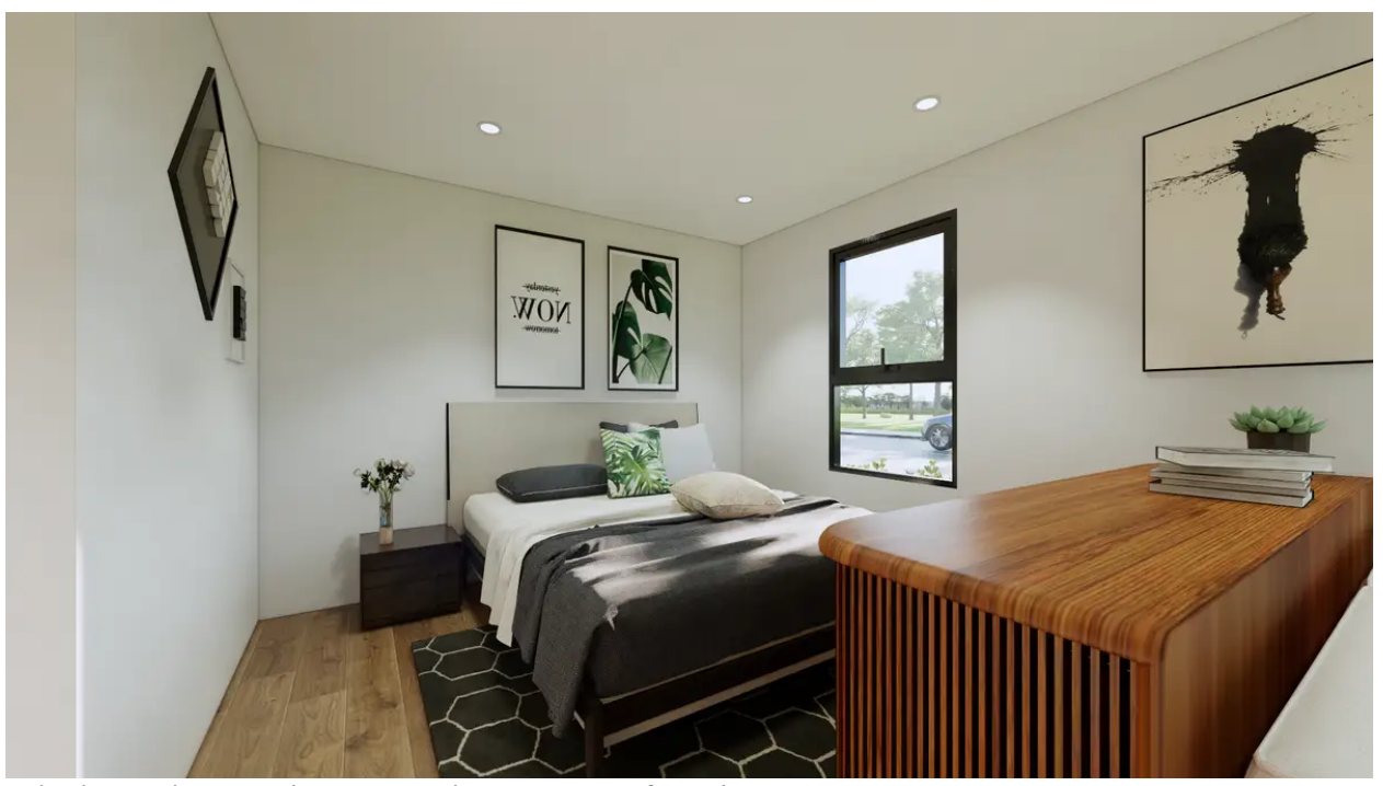
A bedroom in a Hapi Homes unit.

All the furniture here is included in the fully furnished version.