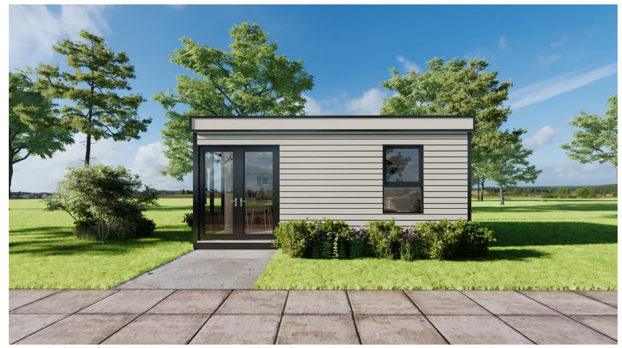
A rendering of the Heuston.

The Heuston, unfurnished, costs $50,000. The furnished version of the Heuston costs between $60,000 and $75,000.