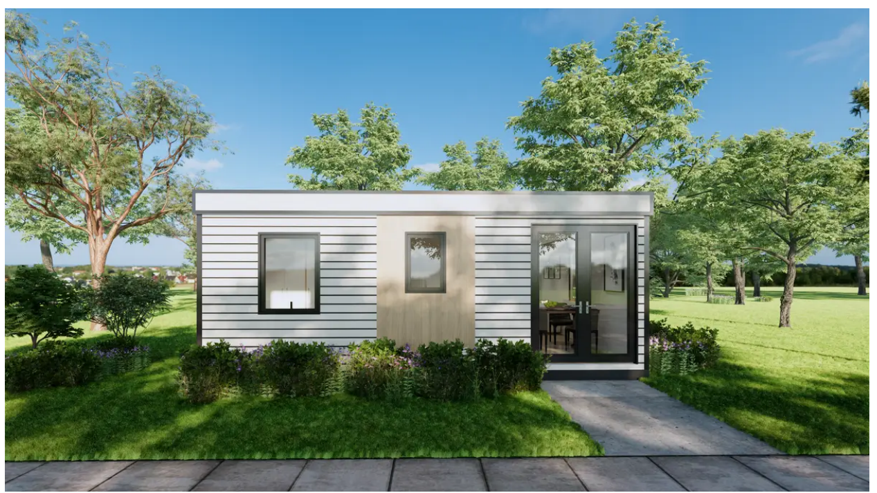
A rendering of the Glenflesk unit.

The exterior of the unit is designed for resistance, Ahmed told Insider.