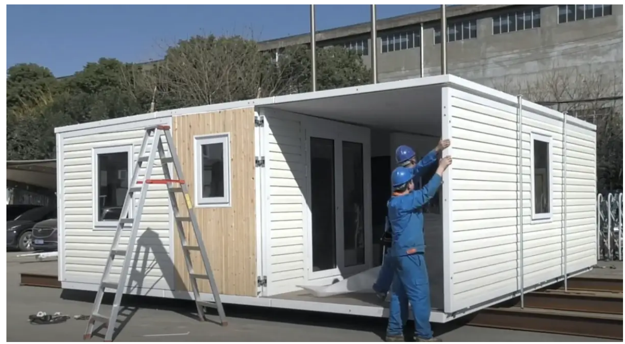
Builders towards the end of unfolding the exterior walls. Hapi Homes/YouTube

When it's all unfolded, this is what one of the Glenflesk units looks like.