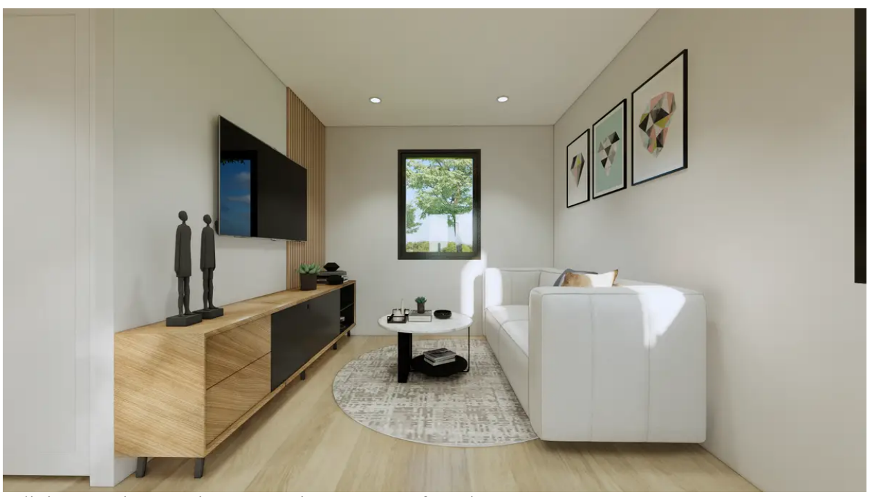
A living area in a Hapi Homes unit.