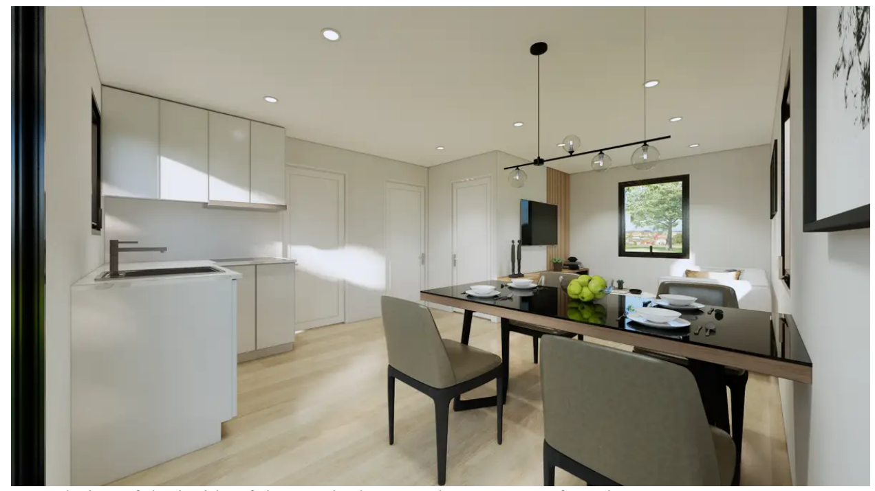
A rendering of the inside of the two-bedroom unit.