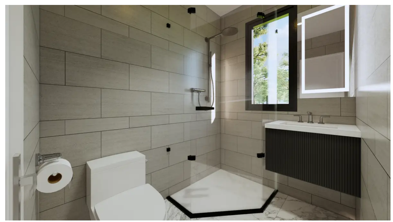
The bathroom in a Heuston.

Both the Heuston and the Glenflesk have bathrooms that include porcelain toilets, compressed wood cabinets, and stainless steel faucets.