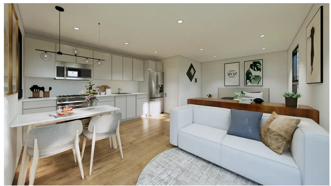
The living area in the Heuston.

Both the Heuston and the Glenflesk have bathrooms that include porcelain toilets, compressed wood cabinets, and stainless steel faucets.