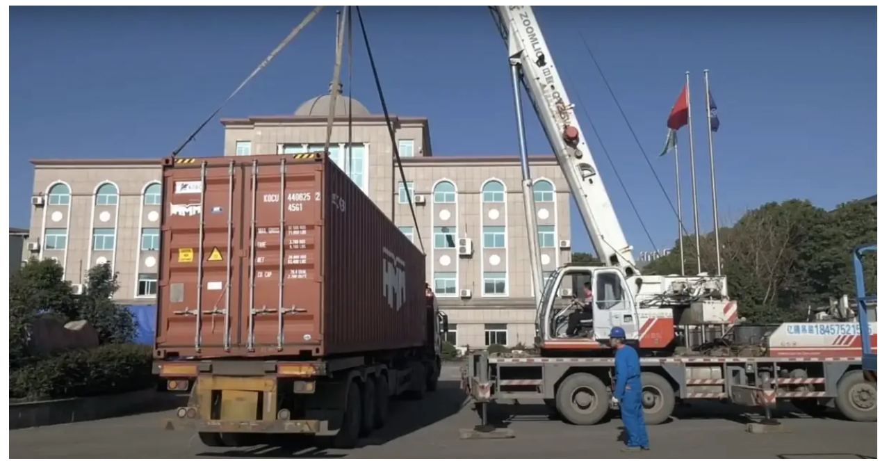
The folded unit being lifted by the crane.

The outer portions of the house fold inward on both sides of the center. Builders unfold the roof and floor first.