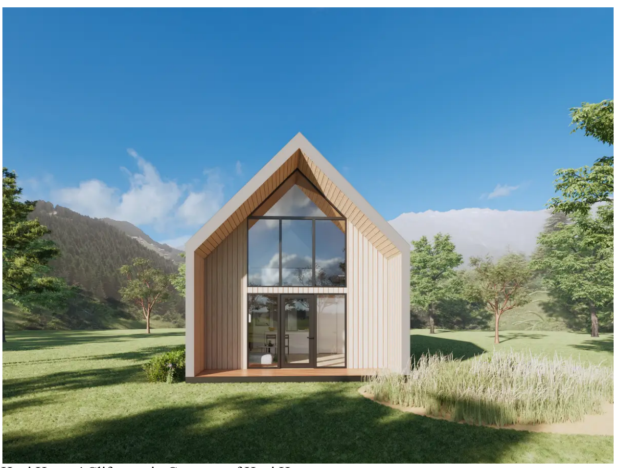
Hapi Homes' Clifton unit. Courtesy of Hapi Homes

The units can be as simple as a tiny home no bigger than a shed, or as grand as a two-story, full-sized home.